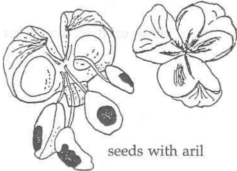
seeds with aril