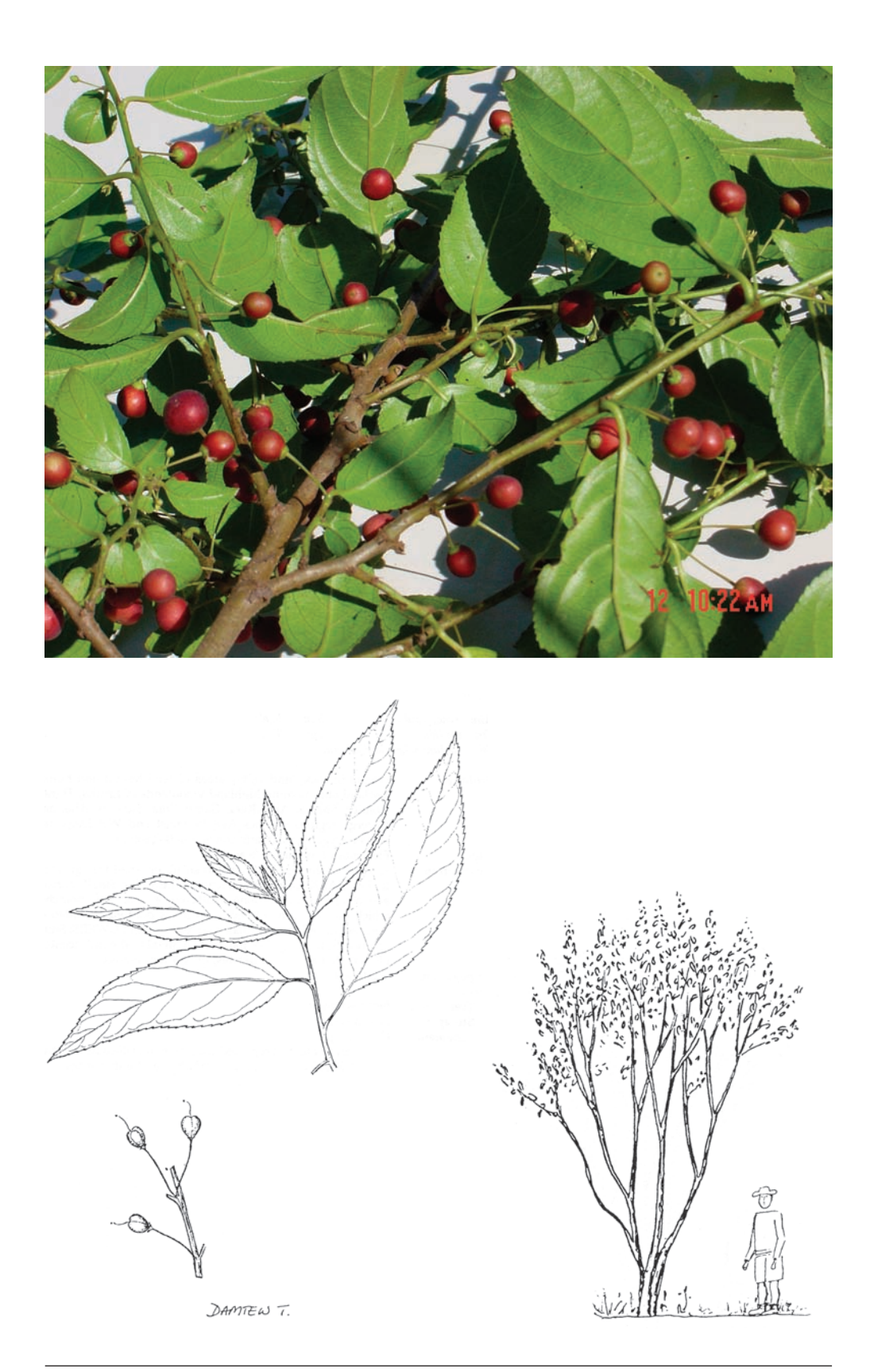
Useful Trees and Shrubs of Ethiopia | 429