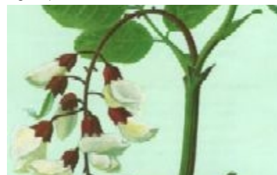
Leaves and flowers (Arnoldo Mondadori Editore SpA)