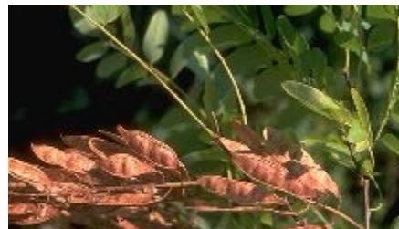
Ripe pods of R. pseudoacacia.