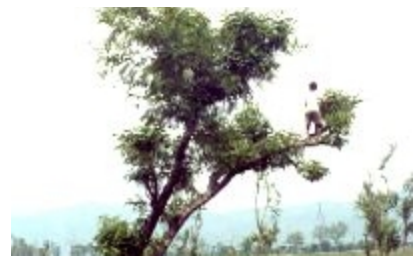
Dalbergia sissoo being lopped for fodder in southern Nepal. (Martien Gelens)

At 9 months, D. sissoo starts producing flowers profusely. The small bisexual flowers are borne on small branches from the leaf axis. Little is known of pollination biology and breeding system. The species appears to be insect pollinated, and trees can apparently be both self- and out-crossing to varying degrees, depending on local conditions. Flowering closely follows leaf flushing; leaves fall and young flower buds appear with new leaves followed by complete pod formation and maturity. Mature pods remain attached to the tree for 7-8 months and are then dispersed by wind and water.