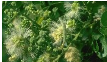
P. dulce : cream-coloured flower heads. (Colin E. Hughes)