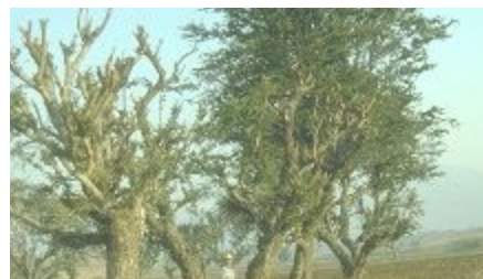
P. dulce : medium-sized trees lopped for dry season livestock fodder, Oaxaca, Mexico.

In the Philippines they flower from October to November and bear mature fruits in abundance during January and February; in west Java bloom is between April and June and the pods ripen 2-3 months later, from June to August.