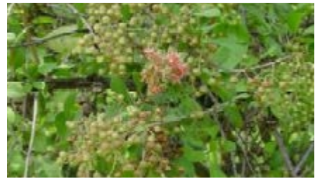
fruits and foliage (Trade winds fruit)

Birds feed on the fruits of L. inermis and probably disperse the seeds.