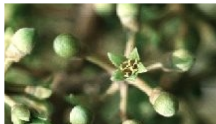
Close-up of flowers, Brazil (Anthony Simons)