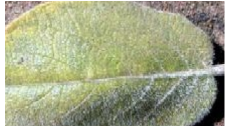
Leaf (Botha R.)

Flowers appear before the leaves and are attractive to insects, which probably pollinate them. Flowering in southern Africa occurs from September to November; in Zambia, between July and October; fruit ripens between June and September.