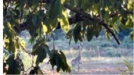
Densely foliated tree (Botha R.)