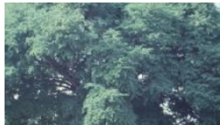
Tamarindus indica