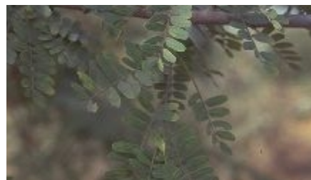
Tamarindus indica foliage (Joris de Wolf, Patrick Van Damme, Diego Van Meersschaut)

Flowering generally occurs in synchrony with new leaf growth, which in most areas is during spring and summer. The hermaphroditic bisexual flowers are probably insect pollinated; however, no specific information has been found on pollinating agents, except that honeybees collect nectar and pollen from the flowers so, presumably, they contribute to pollination. T. indica usually starts bearing fruit at 7-10 years of age, with pod yields stabilizing at approximately 15 years. Fruits are adapted to dispersal by ruminants; in Southeast Asia, monkeys are among the chief dispersal agents. Fruit are leathery, nutritive pods that do not dehisce until they have fallen from the tree, while the seeds are hard and smooth and therefore hard to chew.