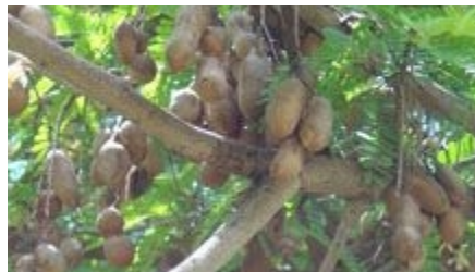
Fruits showing sticky pulp around seeds. (Anthony Simons)