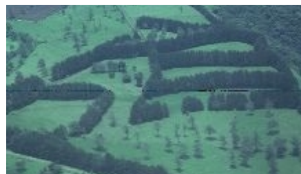
C. lusitanica windbreaks in dairy pasture, Volcan Barba, Costa Rica.