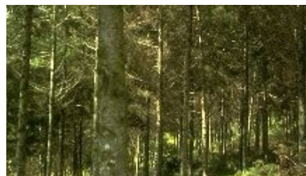
C. lusitanica unthinned plantation, Cartago, Costa Rica.