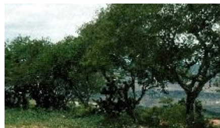
Small trees along terrace boundaries: Trees to about 5m height, cultivated along terrace boundaries, Oaxaca, Mexico. (Colin Hughes)

The flowering season begins in May and lasts up to October, while fruiting occurs mainly between December and March. The tree is leafless during part of the dry season from December to March.