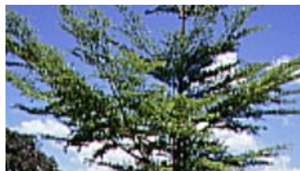
The layered branches are a feature of this species. (Ellis RP)