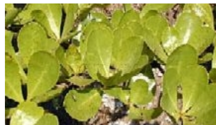
The bright-green, smooth, almost waxy leaves are borne in terminal rosettes of 4-9 unequal leaves. (Ellis RP)

The generic name comes from the Latin 'terminalis' (ending), and refers to the habit of the leaves being crowded at the ends of the shoots.