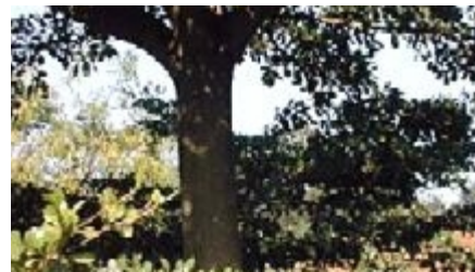
The main stem is straight, erect and smooth with the layered branches arising horizontally in whorls. Here from Nairobi. (Ellis RP)