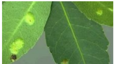
Leaflet galls with crater-like ostioles caused by microscopic mites of the Eriophyoidea. (Neser S)