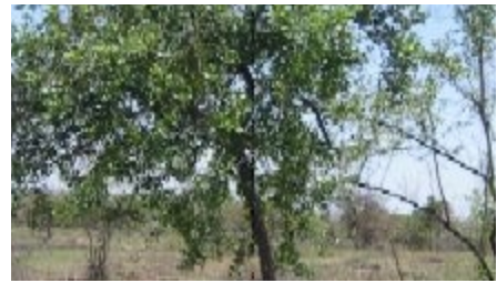
Tree growing in Masai land Kenya (Bob Bailis)