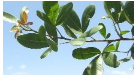
R. natalensis foliage