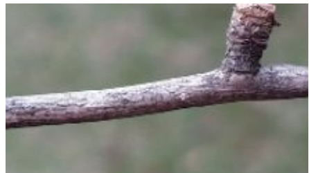
Leaves (Tamara Crupi, September 1996)