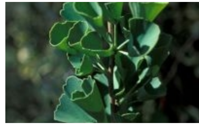
Leaves at Kula Experiment Station, Maui, Hawaii