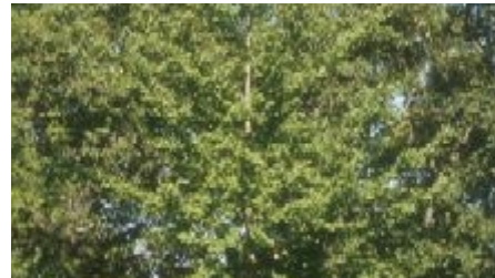
habit (Tamara Crupi, September 1996)