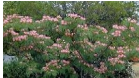
Quick growing, flat-topped crown. Branches in lateral tiers. Long feathery fern-like leaves up to 45cm long - provide light shade. Spectacular in flower - from early summer to autumn. Ornamental used as avenue tree and lawn shade. (Ellis RP)