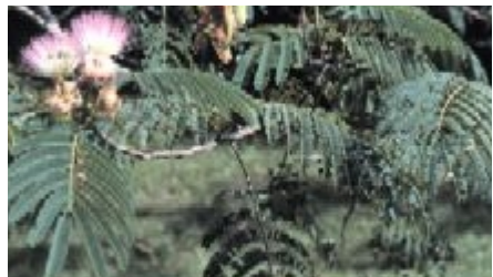
Detail of masses of pink, puff-ball shaped, feathery and silky flowers borne above the foliage (Ellis RP)