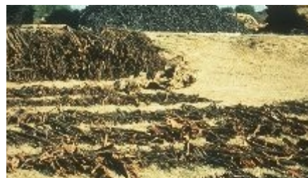
A. nilotica is one of the most widely planted and used trees in northern India for tannin from bark (foreground), firewood (middle) and charcoal (background), as here in the Punjab.

The yellow sweetly scented flowers are nectarless and found in round heads. Most flowers are functionally male with a few hermaphrodites and are mainly bee-pollinated. Leaf production and fall are affected by rainfall whereas temperature affect flowering and fruiting. In Sudan A. nilotica flowers irregularly but generally between June and September and seed fall takes place from March to May. In Australia trees flower from March to June and green pods are produced within four months but ripe pods fall from November to February. Most of the leaf fall occurs during the dry period when the tree bears green pods.