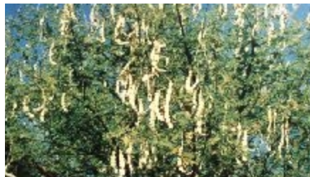
A. nilotica var. cupressiformis , valued for its fastigate branching and narrow columnar crown suggesting unusual agroforestry potential, here in trials at the Central Arid Zone Research Institute, Rajasthan, India. (Colin E. Hughes)