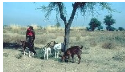
Typical tree of A. nilotica , being lopped for livestock fodder in Rajasthan, India. (Colin E. Hughes)