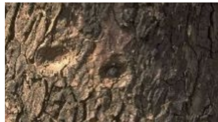
S. birrea bark. (Roeland Kindt)