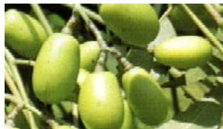
Immature fruits (Schmutterer H.)

A. indica trees may start flowering and fruiting at the age of 4-5 years, but economic quantities of seed are produced only after 10-12 years. Pollination is by insects such as honeybees. Certain isolated trees do not set fruit, suggesting the occurrence of self-incompatibility. The flowering and fruiting seasons largely depend on location and habitat. In Thailand for instance, neem flowers and fruits throughout the year whereas in East Africa (with pronounced dry and wet season) flowering and fruiting are restricted to distinct periods. Fruits ripen in about 12 weeks from anthesis and are eaten by bats and birds, which distribute the seed. They can live for over 200 years.