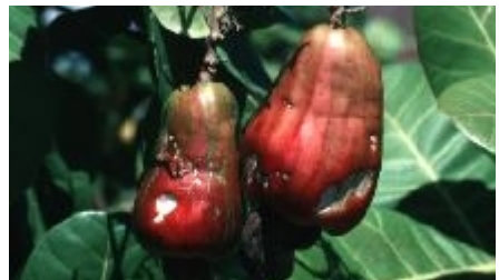
Anacardium occidentale foliage