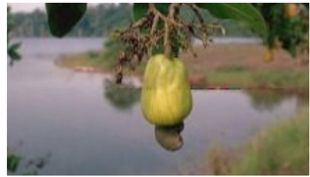
Immature fruit.