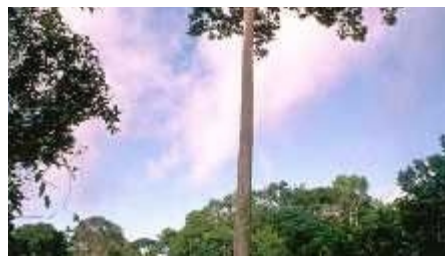
Emergent tree (55m) in Tapajos forest, Brazil.

B. excelsa begins flowering during the drier months, and the flowers drop soon after opening during the early part of the season. B. excelsa trees are self-incompatible, and the hooded bisexual flowers prevent wind pollination. Flowers are pollinated by bees in the genera Xylocarpa, Bombus, Centris, Epicaris and Eulaema. A pronounced dry season is necessary for good fruit set. Fruiting starts at 12-16 years in the forest and as early as 8 years if trees are well managed in the open. Mature nuts are produced approximately 15 months after fertilization and take 1 year to ripen. Nuts are dispersed mainly by rodents.