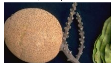
Open fruit (southern Peru)