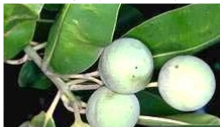
Leaves at Kalepolepo Kihei Maui, Hawaii