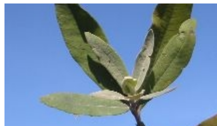
T. camphoratus leaves. Note the velvety look. (Bob Bailis)