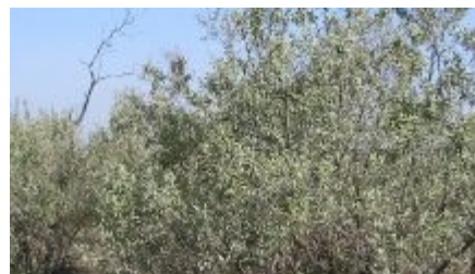
Shrub of T. camphoratus (Bob Bailis)