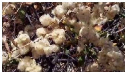
Sexes separate, on different plants. Flowerheads in terminal panicles. Individual flowers creamy-white, grouped into 3-5 flower capitula. Covered in white woolly hairs. (Fouché HJ)