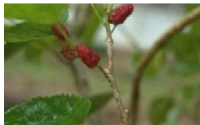
Mulberry fruit (French B.)