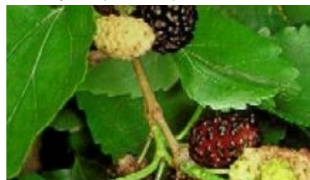
Leaves and fruits.