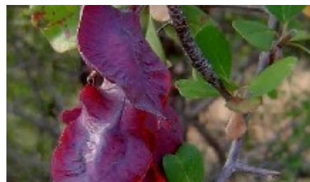
Leaves (Bart Wursten)

Trees flower from spring to summer in South Africa, while in Kenya, trees flower in years with normal climatic conditions from March to June. After pollination by insects, fruit development takes about 5-6 months. Brown-headed parrots eat the fruits, and probably disperse the seeds.