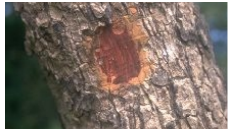
Trichilia emetica slash