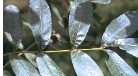
Trichilia emetica foliage