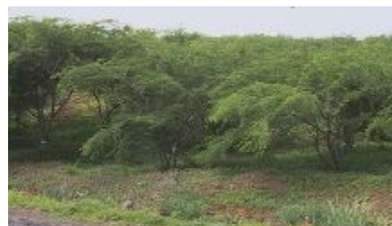
P. juliflora , plantation with pods, Saotiago, Cape Verde Islands. (David Boshier)