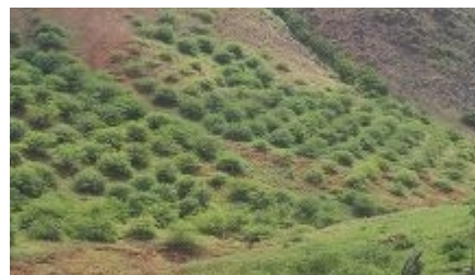
P. juliflora , contour planting, Saotiago, Cape Verde Islands. (David Boshier)

P. juliflora inflorescence is small, green-yellowish spikes without any particular fragrance or attractiveness, though relished by bees. Flowering begins at the age of 3-4 years. In India, P. juliflora flowers twice a year, in February-March and August-September, and is a prolific seeder. The pods from autumn flowering mature by May or early June and are dispersed before the onset of the monsoon. In drought years, autumn flowering is extremely affected, with trees often failing to flower, but these same trees flower and fruit subsequently when there is adequate rainfall. The bisexual, pealike flowers are cross-pollinated by wind and insects. The seed is disseminated and pretreated by the agency of animals that feed on the pods.