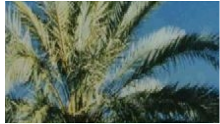
A tree affected by Fusarium oxysporum f.sp. albedinis showing wet feather symptoms