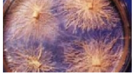
Fusarium oxysporum f.sp. albedinis cultures (FAO in collaboration with CABI)