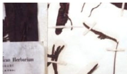
Common tree of Ngangao forest, Taita Hills.