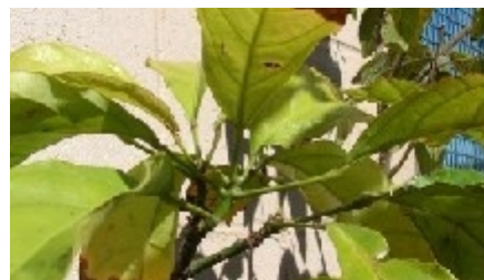
Leaves. Lowes Garden Center Kahului, Maui, Hawaii

The tree is evergreen. Flowering period is for 3 months (May to July in Ghana) followed by fruiting for 3 months (October to December in Ghana).