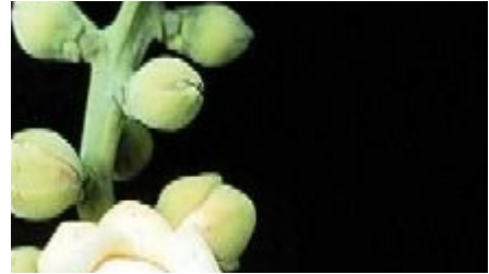
Inflorescence (Mori S.A.)