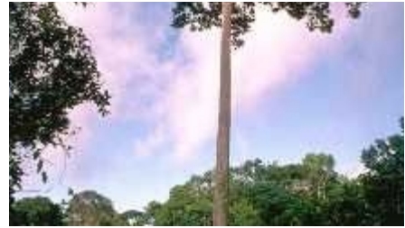
Emergent tree (55m) in Tapajos forest, Brazil. (Anthony Simons)

B. excelsa begins flowering during the drier months, and the flowers drop soon after opening during the early part of the season. B. excelsa trees are self-incompatible, and the hooded bisexual flowers prevent wind pollination. Flowers are pollinated by bees in the genera Xylocarpa , Bombus , Centris , Epicaris and Eulaema . A pronounced dry season is necessary for good fruit set. Fruiting starts at 12-16 years in the forest and as early as 8 years if trees are well managed in the open. Mature nuts are produced approximately 15 months after fertilization and take 1 year to ripen. Nuts are dispersed mainly by rodents.