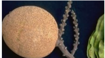
Open fruit (southern Peru)