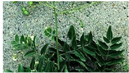
Bough with inflorescence (Darren Kimmbler)