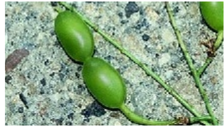
fruit (Darren Kimmbler)