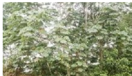
Musanga cecropioides : Tree: A disturbed site on the Kumasi-Wassa Akropong road in the Western Region of Ghana. (Dominic Blay Jr.)