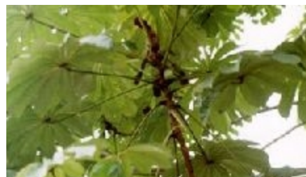
Musanga cecropioides : Canopy (Dominic Blay Jr.)

The fruits are dispersed by elephants and other animals.