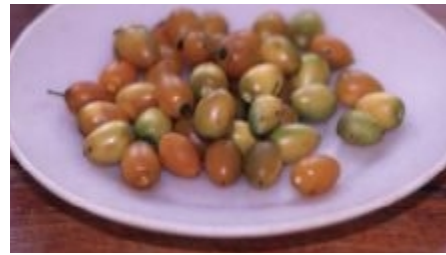
Berchemia discolor (Anthony Njenga)

It takes about 4-5 months from flower fertilization to fruit ripening; flowering starts at the onset of rains, while fruit ripening occurs towards the end of the long rains. In South Africa, for example, flowering occurs from October to January and fruiting from January to July.