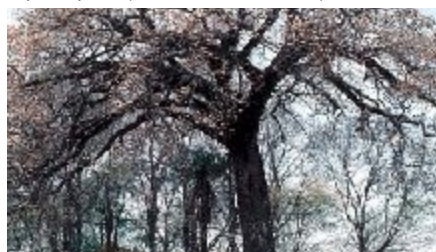
Trunk