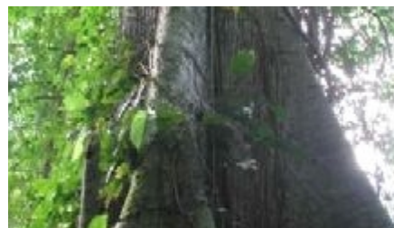
Buttress (L. Gilbert UT Austin)

Flowers open at night, emitting a powerful odour and secreting nectar at the base of the large, bisexual flowers. The pollen is sticky, and the shape of the flowers suggests cross-pollination, although self-pollination may occur when stamens and stigmas of adjacent flowers of the same tree come into contact. Flowers open soon after dark and fruit bats visit them. Hawk moths and several other small moths also visit the flowers at night and many bees visit soon after dawn. Seeds are widely disseminated and find ideal conditions for germination in abandoned agricultural land.