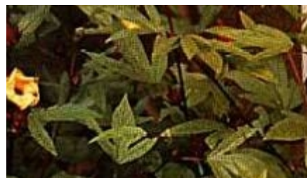
Detail of flowers and leaves. (Morton J.)

H. sabdariffa is a hermaphroditic and insect pollinated shrub. The species hybridizes with Hibiscus cannabinus . Roselle plants exhibit marked photoperiodism, not flowering at short days of 13.5 hours, but flowering at 11 hours. In the United States plants do not flower until short days of late fall or early winter.