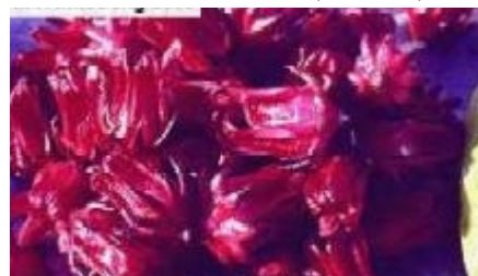
Harvested calyces. (Armstrong W.P.)