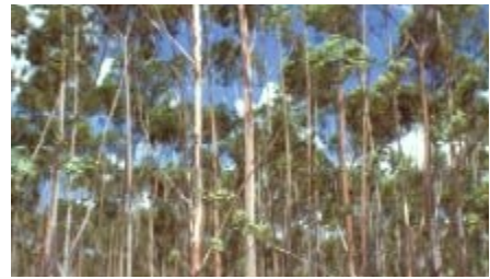
8-year old stand in south Florida, USA.

The flowers are bisexual, with fertile male and female organs on the same flower. Pollination is dependent on insects or animal vectors. Like many Eucalyptus species, it has a tendency to out-breed.