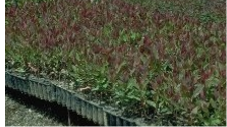
E. grandis , 11 week old rooted cuttings, Carton de Colombia, Colombia. (David Boshier)