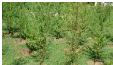
Seven month old Artemisia annua at the ICRAF campus (AFT team)