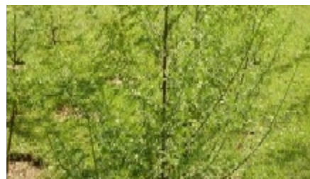
Seven month old Artemisia annua at the ICRAF campus (AFT team)