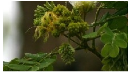
Flowers and leaves (Bart Wursten)

Flowering occurs from September to December and fruiting from December to March in South Africa.