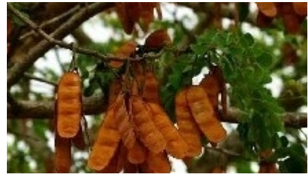
Pods (Bart Wursten)