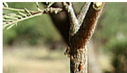
Albizia amara

The yellow or pinkish-white, fragrant flower heads appear mainly in the rainy season, and the fruits ripen in the cold season.