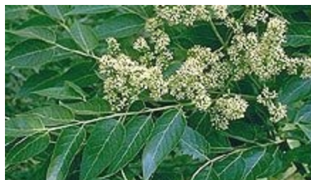
Flowers and foliage