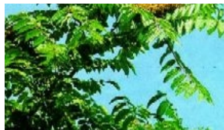
Leaves and fruits.