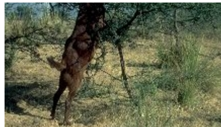
Goats browsing nine-year old Acacia tortilis planted for sand dune stabilization near Jodhpur, Rajasthan, India.