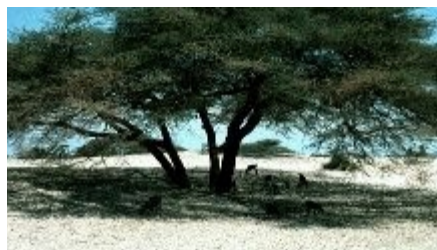
14-year old plantation of Acacia tortilis, planted for sand dune stabilization, near Jodhpur, Rajasthan, India.