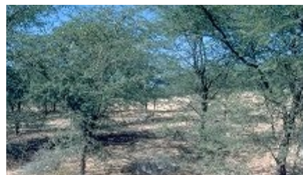
Nine-year-old plantation of Acacia tortilis planted at 4 x 4m spacing for sand dune stabilization, near Jodhpur, Rajasthan, India.

A. tortilis is a hermaphrodite. Gravity or propulsion from drying dehiscent pods initiates seed dispersal. In India, trees flower between May and June and fruit by mid July, and in Nigeria flowers appear in May-June and fruits in July.