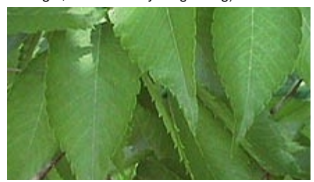
Leaves; taken at: Blake Garden -Kensington, CA and The National Arboretum - Washington, DC