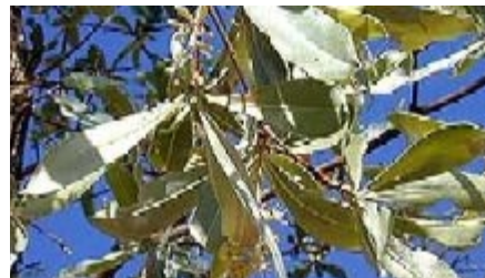
The leaves are clustered towards the tips of the branches; 55-120 x 15-45 mm large and densely covered with silky, silvery hairs. The branchlets are dark brown or purplish; peeling in rings and strips. (Botha R)