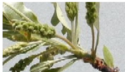
Young leaves with silver hairs, giving the tree a characteristic silver shine. Simple leaves, spirally arranged and clustered at the end of the branches. (Ellis RP)

It flowers in September and January and fruits in January to May, fruit remaining on the tree almost until the next flowering season. Pollination is usually by flies.