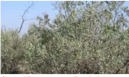
Shrub of T. camphoratus (Bob Bailis)