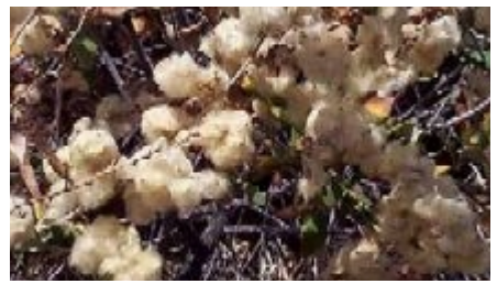
Sexes separate, on different plants. Flowerheads in terminal panicles. Individual flowers creamy-white, grouped into 3-5 flower capitula. Covered in white woolly hairs. (Fouché HJ)