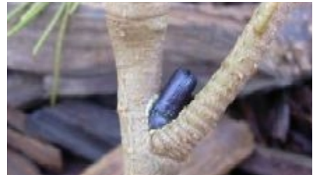
Plant at Kekaha, Kauai, Hawaii