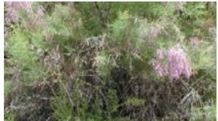
Flowers at LZ1 Kahoolawe, Hawaii