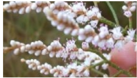
Flowers at LZ1 Kahoolawe, Hawaii

The leaves and branchlets are shed during the cold season, the new shoots and leaves appear about May. The species is monoecious and the small pinkish flowers appear from May to July, and capsules ripen in the cold season. In some parts of India, the seeds ripen in the middle of July to middle November. Ripe capsules turn brown, gradually open up and the seed is blown away.