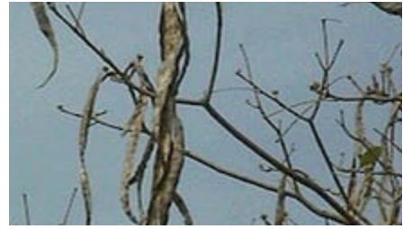
Fruit; taken at: Los Angeles County Arboretum - Los Angeles, CA and Quail Botanical Gardens - Encinitas, CA (W. Mark and Reimer)

T. impetiginosa flowers in spring after light winter rains between December and February just before setting new leaves. In its native habitat, it blooms when few leaves are present probably to attract more pollinators. Carpenter bees are probably the primary pollinators, but some bird species could also be responsible.