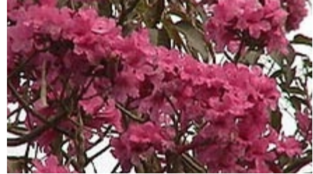
Flowers; taken at: Los Angeles County Arboretum - Los Angeles, CA and Quail Botanical Gardens - Encinitas, CA