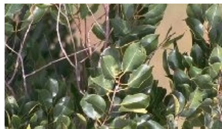
Syzygium guineense foliage

S. guineense is able to interbreed with other species in the genus. Pollination agents are insects. Where there are 2 rainy seasons, the species flowers twice: during the short dry season and towards the end of the long rains. In areas with 1 rainy season, the species flowers once, starting towards the end of the dry season and extending into the rainy season.