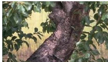
Syzygium guineense bark