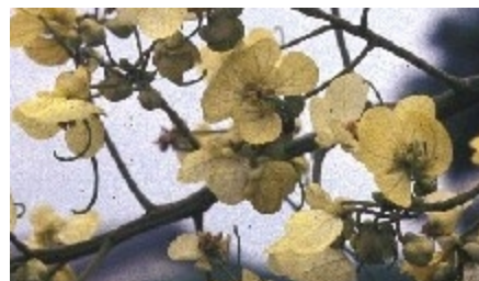
Leaves and flowers (G.A. Cooper @ USDA-NRCS PLANTS Database)

S. singueana is a hermaphroditic species flowering from around April to June. Its fruits are ready for collection around September.