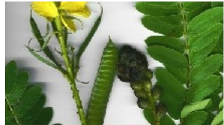
Flowers and fruit at old Kula Rd, Maui, Hawaii.