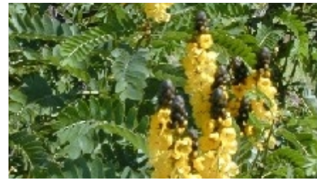
Flowers and leaves at Haiku, Maui, Hawaii.

S. didymobotrya flowers profusely twice a year; in temperate regions it flowers throughout the summer.