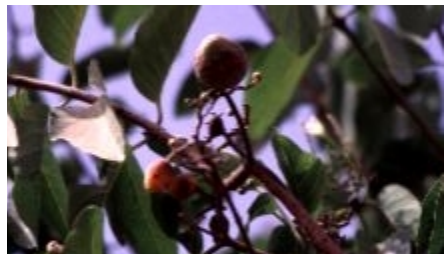
Saba senegalensis